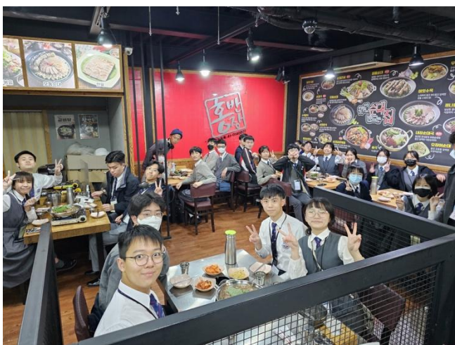
(The first meal in Korea!)

After that, we entered the flight and landed at Seoul successfully. The time we arrived at the local restaurant was 11p.m. already, all of us were dog-tired but the meal with palatable pork and soup was literally the supplement of our bodies. Our energy had been refilled slightly and it was time to rest. The first day of the tour ended after the short briefing by the teachers.