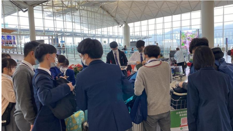
(Everyone was waiting patiently.....)

Unfortunately, the good time did not last long, the boarding time was delayed twice that we could not set off on time. Our class was shrouded in a low-key atmosphere, but we have never complained since we could understand the accident was uncontrollable. With our self-discipline, we spent our spare time in the airport silently such as reading books, studying and taking a nap.